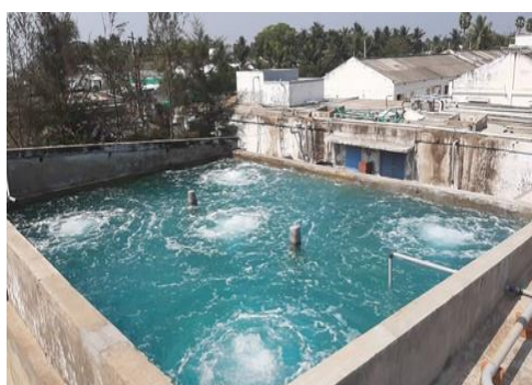
Water Storage System-500 T