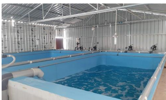
Indoor Hatchery view